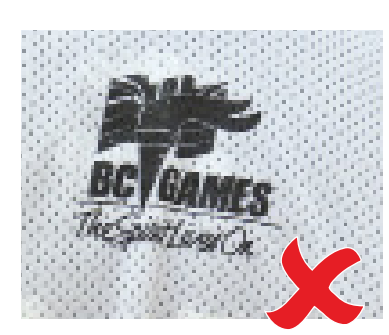
Use the most current version of the logo. Do not use outdated versions of the logo.