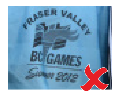
Do not add text to the logo.