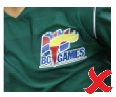
Do not add shadows or outlines to the logo.