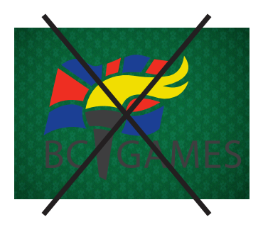
Do not print the logo on a patterned or distracting background.