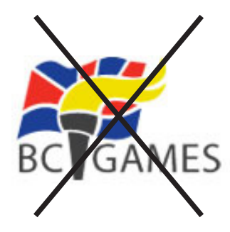
Do not print the logo in a low resolution format.