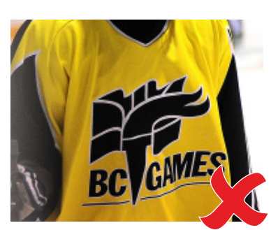
Do not exceed the maximum or minimum size.