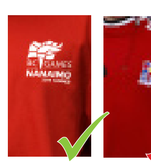
Use a greyscale, black or white version on a clashing or non-contrasting background.