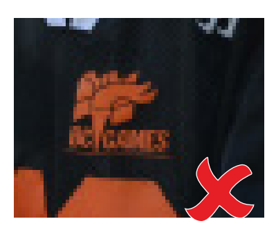
Do not change the colour of the logo .