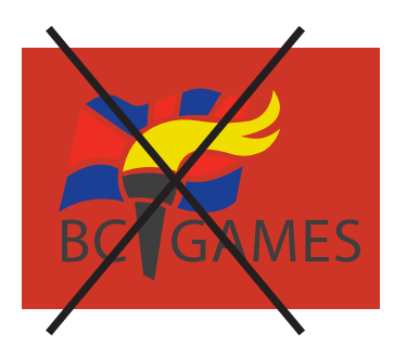
Do not print the full colour logo on a colour that matches or clashes. Use the black, white, or greyscale version.